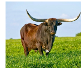
TX W Lucky Lady